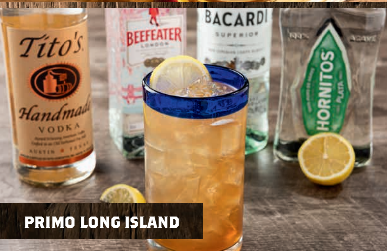
PRIMO LONG ISLAND