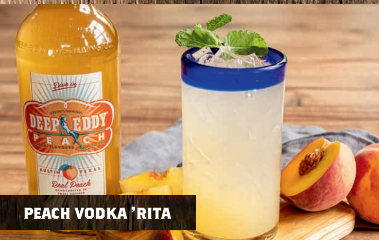
PEACH VODKA 'RITA