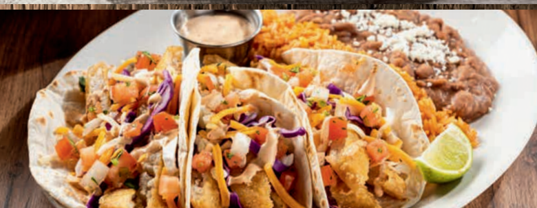
DOS XX® FISH TACOS