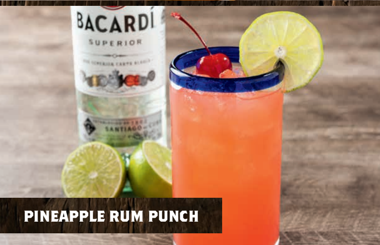
PINEAPPLE RUM PUNCH