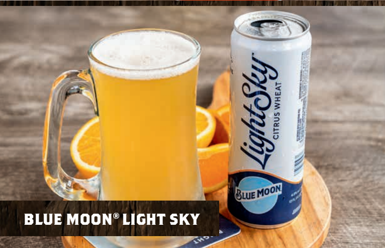
BLUE MOON® LIGHT SKY