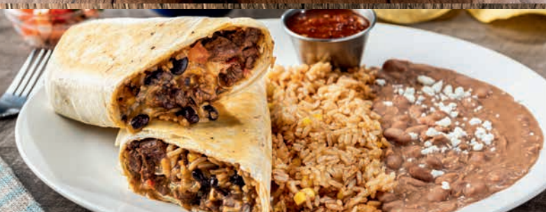
THE BIG BORDURRITO®