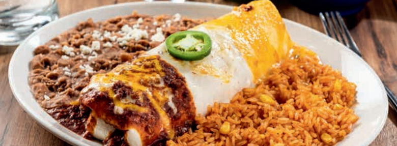
THREE-SAUCE FAJITA BURRITO